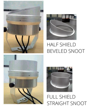
HALF SHIELD BEVELED SNOOT