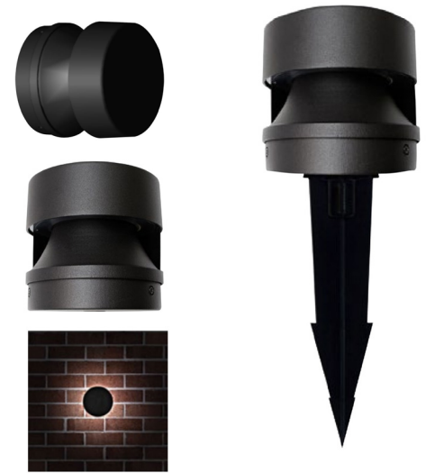
Shown with 180 Degree Shield 5"

Vandal-Resistant Deck, Wall Mount, or Path Light LED Dimmable Luminaire