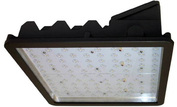
Mounting Bracket Not Included

Multiple Applications and Mounting Options LED Dimmable Luminaire