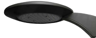
RDA - Round Pole/ Wall Arm