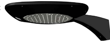
SDA - Square Pole/ Wall Arm