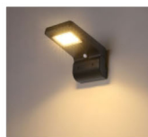
Dark test light