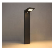
Dark test light