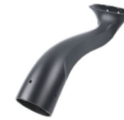
2 Lamp holder