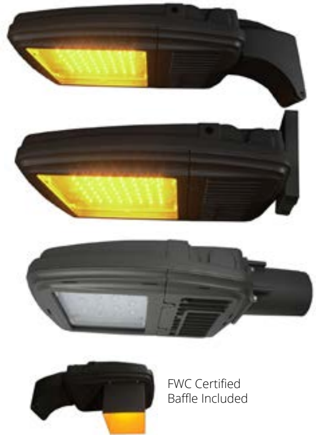
FWC Certified Baffle Included