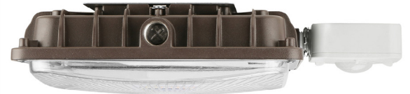
Shown with Motion Sensor