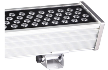
110 degree Rotating Bottom Bracket for easy installation and aiming