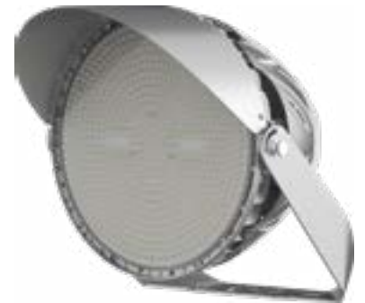
VDSP400 & VDSP500 Shown with Internal Driver & Visor