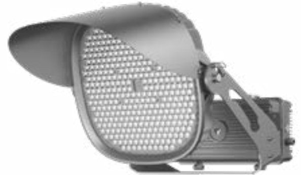
VDSP600 & VDSP800 Shown with External Driver & Visor

Intense Output For Multiple Applications LED Dimmable Luminaire