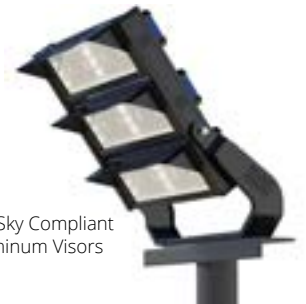
Dark Sky Compliant Aluminum Visors