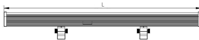
Rotating Bottom Bracket

Static color or white - 9/18/36 LEDs RGB rotating LEDs - R:3/6/12, G:3/6/12, B:3/6/12