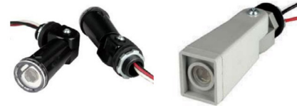
Pencil Photocell Swivel Photocell