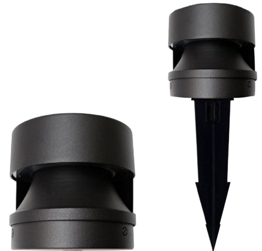
Shown with 180 Degree Shield

Vandal-Resistant Deck, Wall Mount, or Path Light LED Dimmable Luminaire