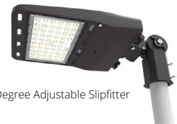
SF - 180 Degree Adjustable Slipfitter