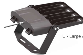
U - Large Adjustable Yoke Bracket