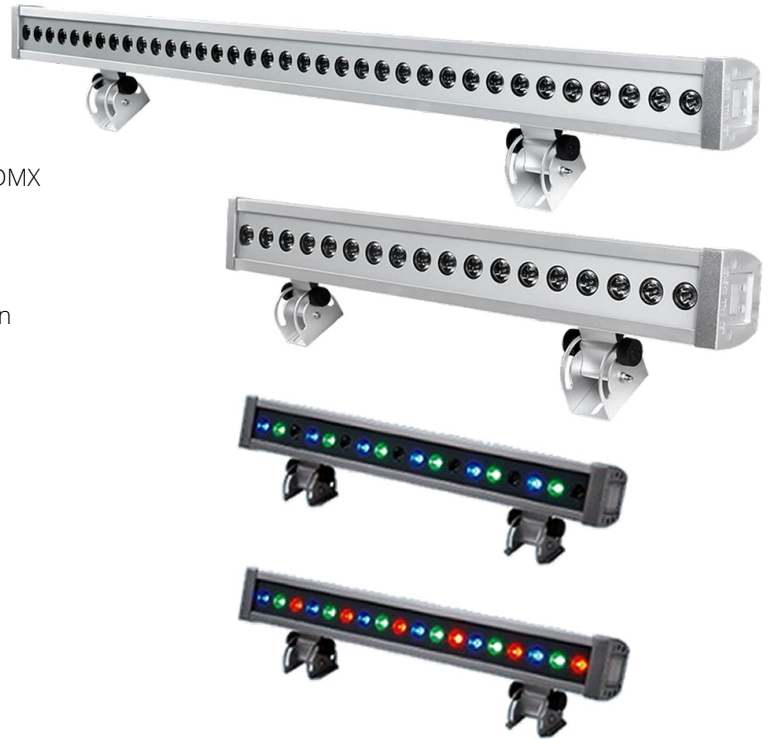
Rotating Bottom Bracket

Static Color, Static White, or RGB Color Changing LED DMX Wash, Stripe or Graze