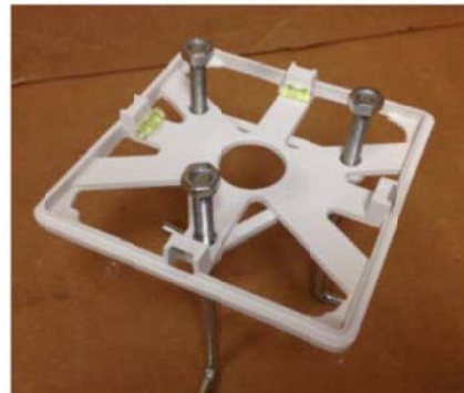
Anchor bolts and template shown Base plate show post template and bolt installations