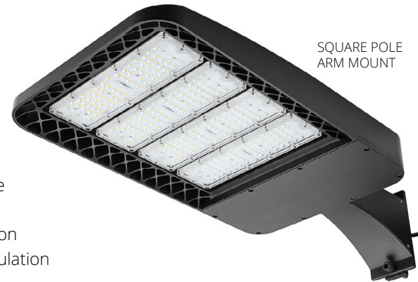
SQUARE POLE ARM MOUNT

Pole Top Slipfitter Accomodates 2 3/8" Tenon or Pole Arm Mount LED Dimmable Luminaire with Sensors