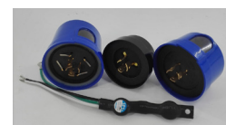
PC - Photocell