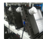
MS - Motion Sensor

The product on this page is a manufactured to order, non-stocking item. This product cannot be returned for refund or credit.